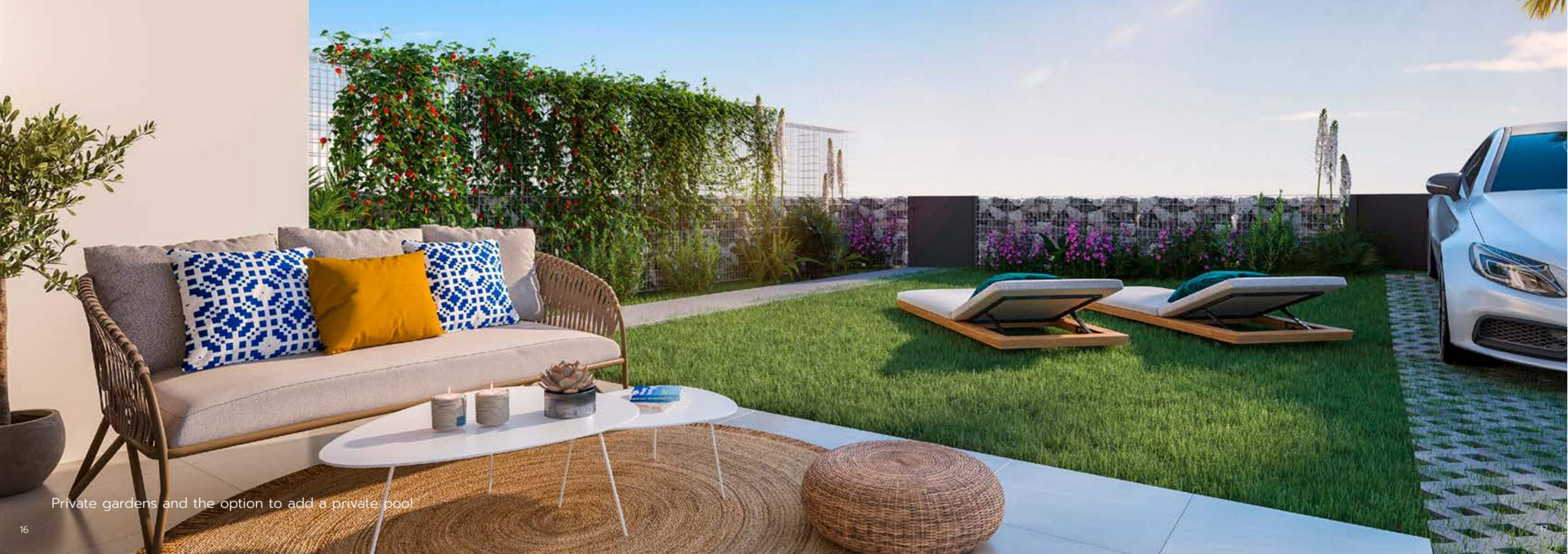
Private gardens and the option to add a private pool