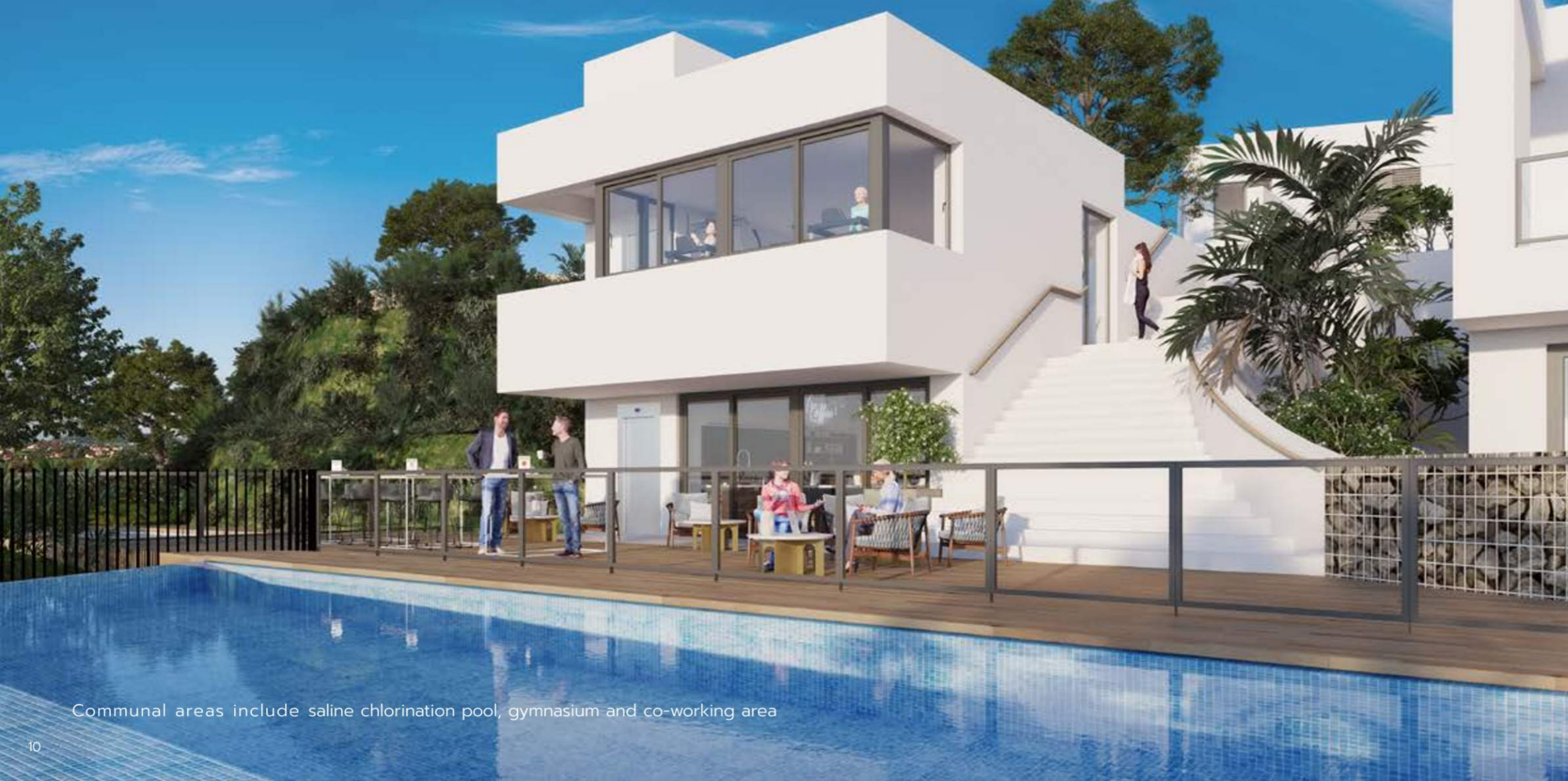
Communal areas include saline chlorination pool, gymnasium and co-working area

The communal areas include a saline chlorination pool with night lighting, gymnasium, co-working area, landscaped garden areas and electric vehicle charging facility.