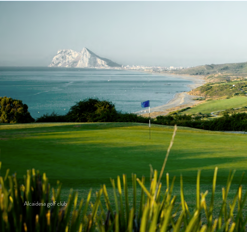
Alcaidesa golf club