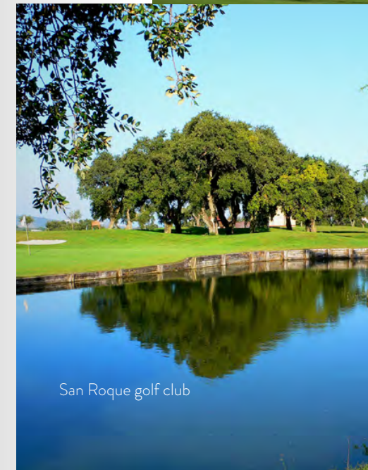
San Roque golf club

La Reserva Club in Sotogrande is just 5 minutes away and has many facilities on offer including the Golf Course, Horse Riding and the original 'The Beach', a fantastic resort beside the Golf Course which includes a restaurant, white sandy beach and lagoon for sports activities etc.