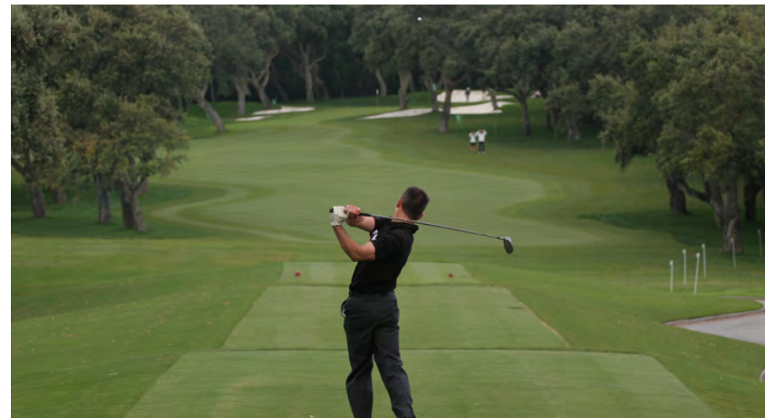
Real club de golf Valderrama