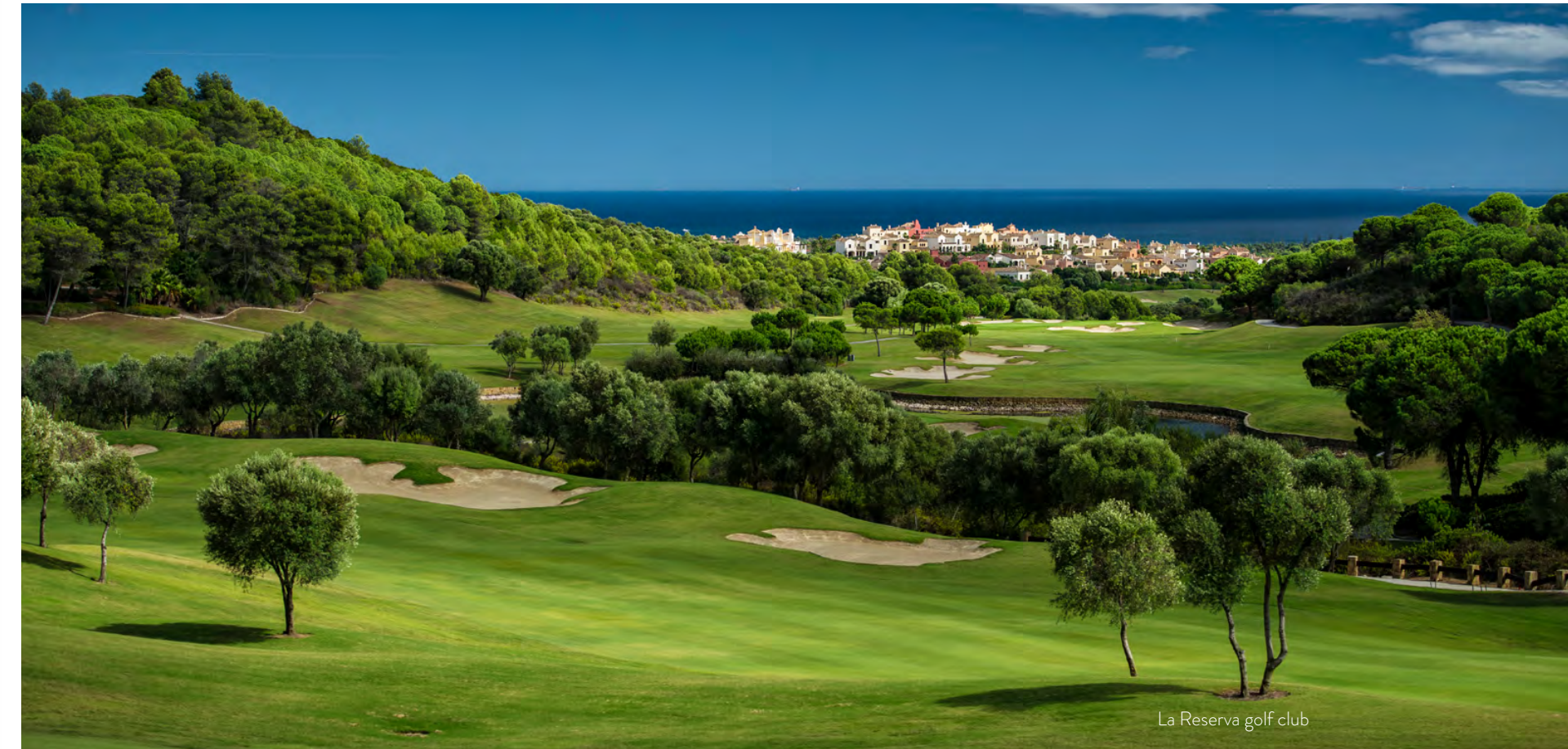
La Reserva golf club