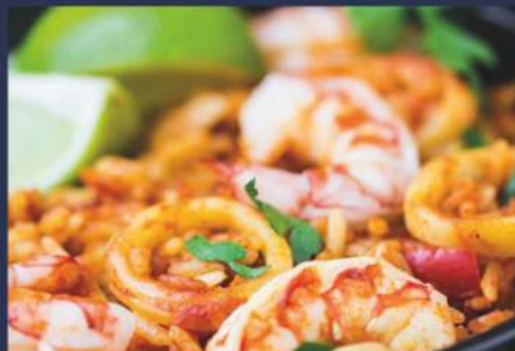
The healthiest restaurants

Worldwide famous, the Mediterranean diet is characterised by the use of local and seasonal products which are a health source and an example of a balanced diet.