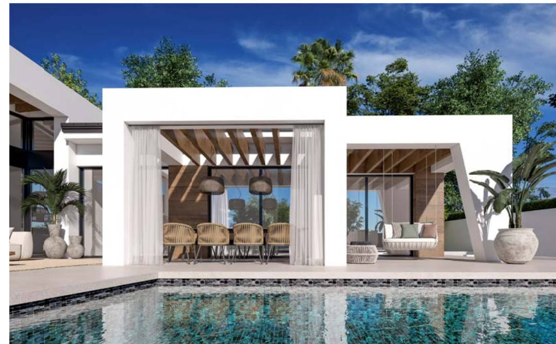
Non-binding figurative image. Optional decoration proposal.