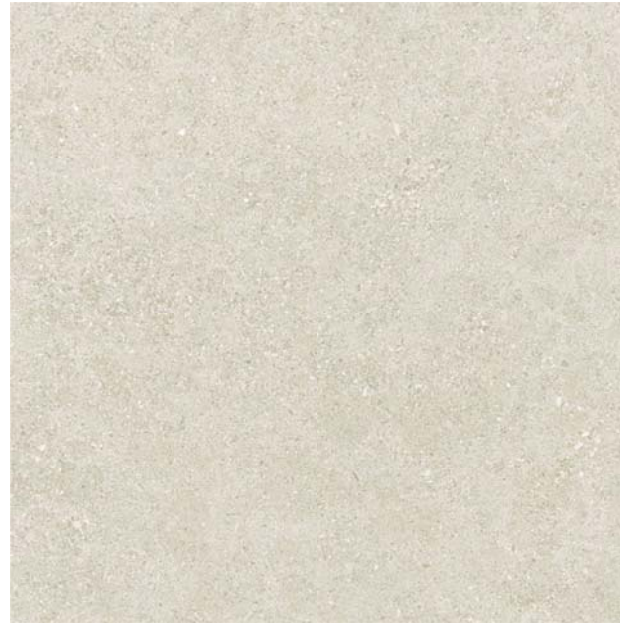
Roadstone Linen 90x90 cm

On main and secondary bedrooms Wood looking rectified porcelain Origin Umber, 22,5 x 180 cm as per below image.