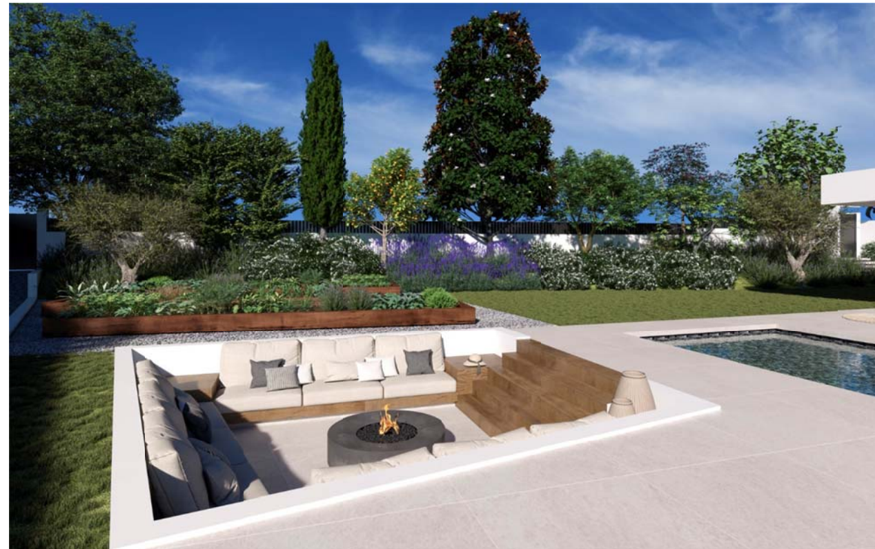
Non-binding figurative image. Optional decoration proposal.

The outdoor areas of each Villa - Marein Natura have been carefully studied thinking about the combination of its special architectural design as each house is projected on a single floor, with its own landscaping and ecological garden so that you can enjoy the freshness of nature , you can cook with your own ingredients and food, perceiving the aromatic species that will characterize your home, while enjoying the maximum use by having large terraces, garden areas, swimming pool and chill out area with winter fire.