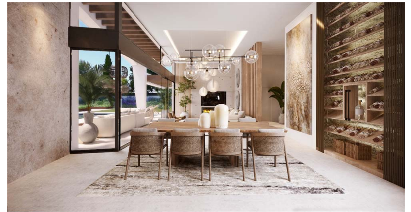
Non-binding figurative image. Optional decoration proposal.

The images shown here are part of the optional interior design proposal.