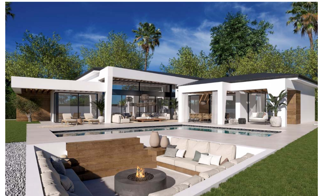
Non-binding figurative image. Optional decoration proposal.