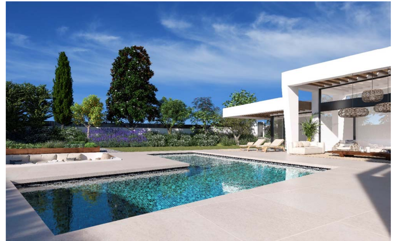
Non-binding figurative image. Optional decoration proposal.