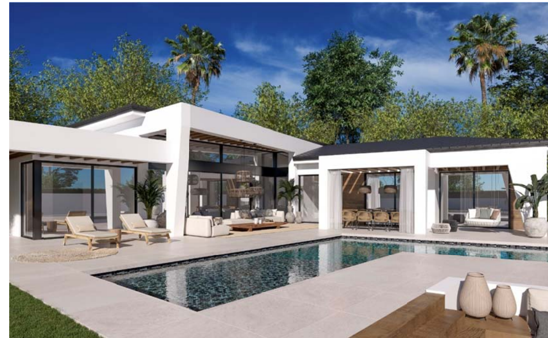
Non-binding figurative image. Optional decoration proposal.

Plasterboard system partition with Rock Wool soundproofing inside, water-repellent plasterboard panels are used in wet rooms. Made according to the guidelines of the CTE-DB-HE regulations. Energy saving; UNE 102040 IN, assembly of plasterboard partitions with metal structure.