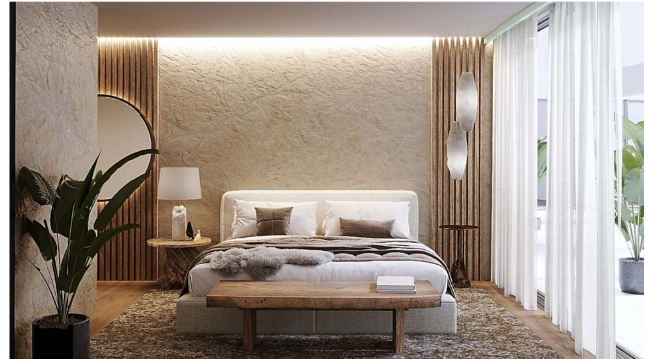
Non-binding figurative image. Optional decoration proposal.