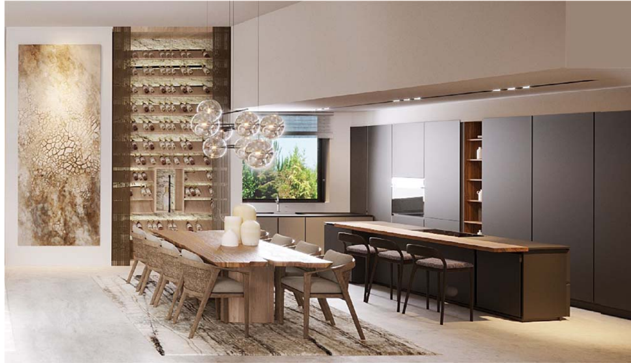
Non-binding figurative image. Optional decoration proposal.

Complete design kitchen, from the Dica brand or similar, equipped with Neff appliances. The matt lacquered fronts in night gray, extremely resistant and very easy to clean and hygienic, have been combined with the Olmo Natur color shelving and countertop bar.