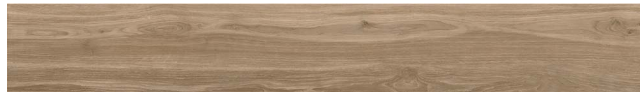
Origin Umber 22,5 x 180 cm

In the main bathroom, a box is designed for the shower and bathtub area, fully tiled and with a great visual effect, with large-format rectified porcelain tiles with a travertine-effect finish.