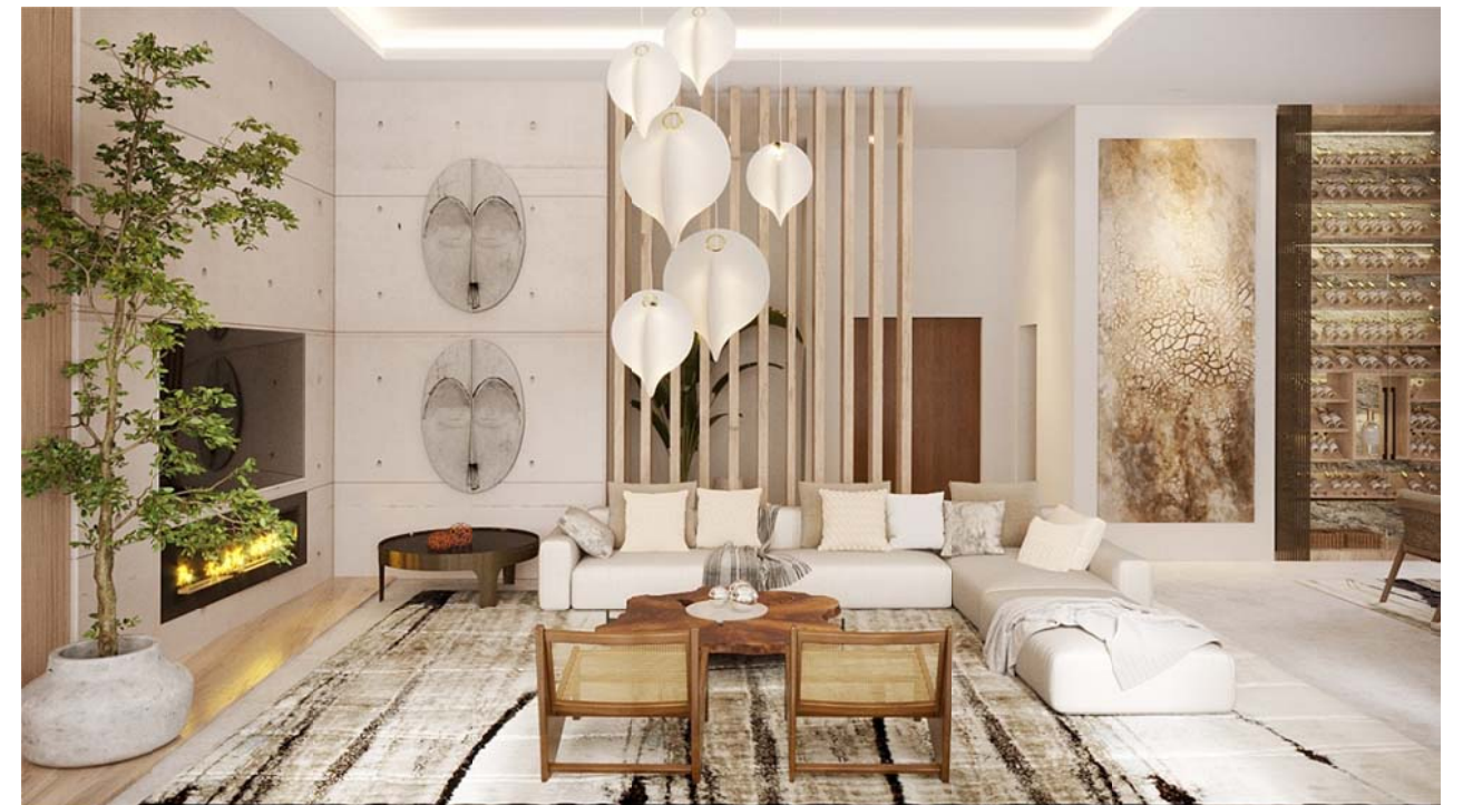
Non-binding figurative image. Optional decoration proposal.