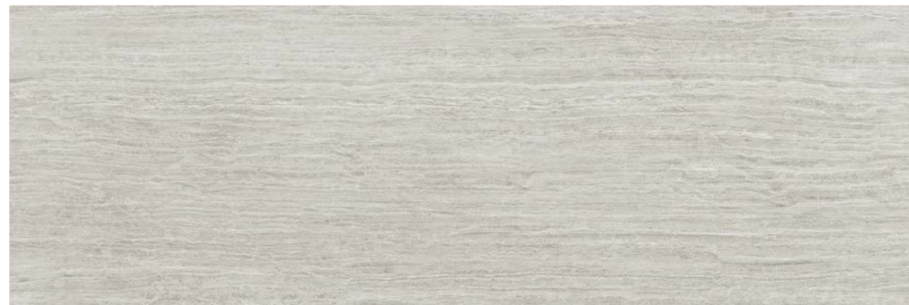
Travertino Grey 100x300 cm

In the main bathroom, a box is designed for the shower and bathtub area, fully tiled and with a great visual effect, with large-format rectified porcelain tiles with a travertine-effect finish.