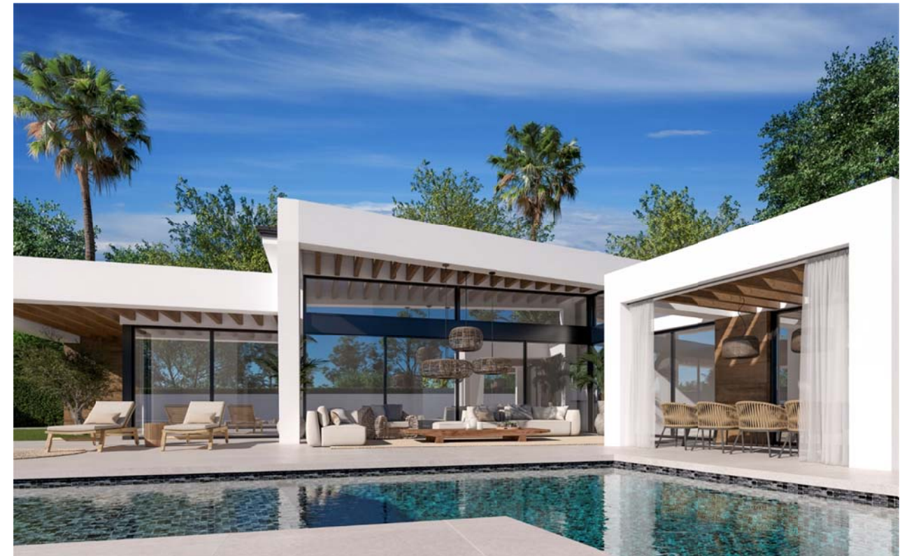
Non-binding figurative image. Optional decoration proposal.