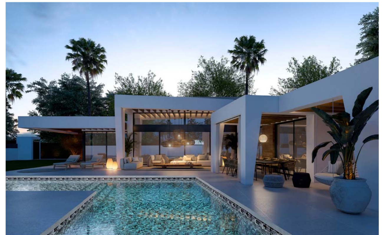
Non-binding figurative image. Optional decoration proposal.

Exterior: Technal, high-quality extruded aluminum with thermal breaks joinery. With the most advanced technologies in the sector and having numerous tests and certificates guaranteeing it. Offering the highest standards on safety and reliability. It will be provided with air intake openings for ventilation.