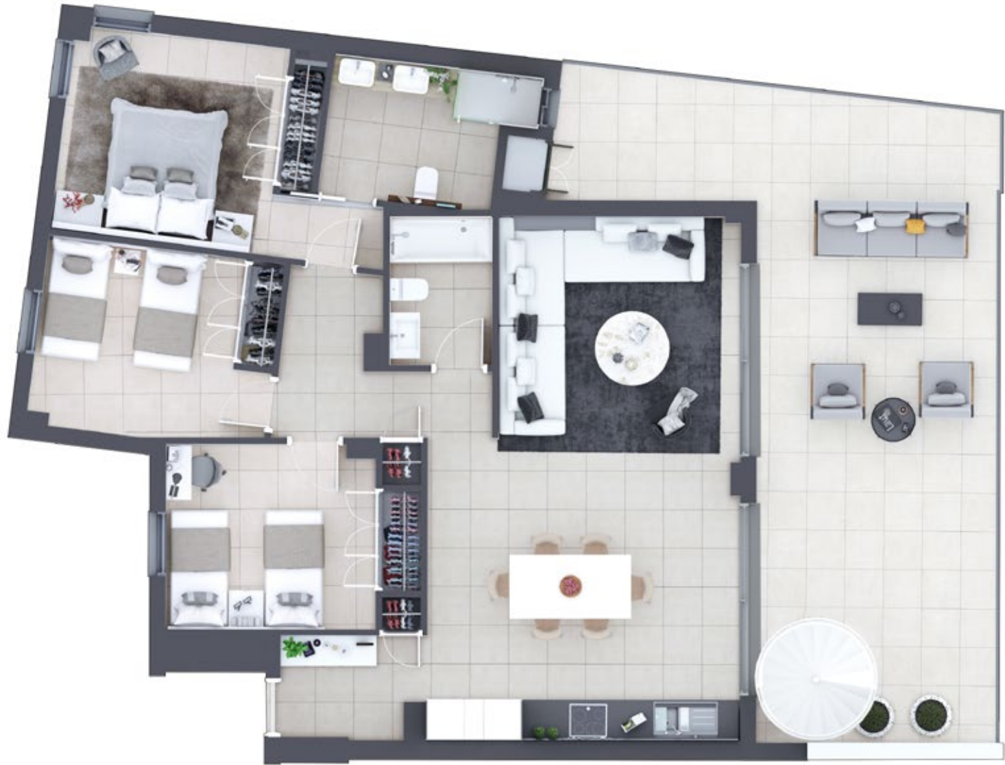
3 BEDROOM LAYOUT