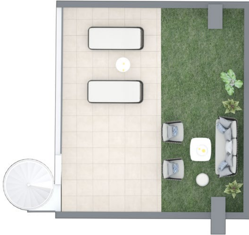
SOLARIUM - 2 BEDROOM LAYOUT