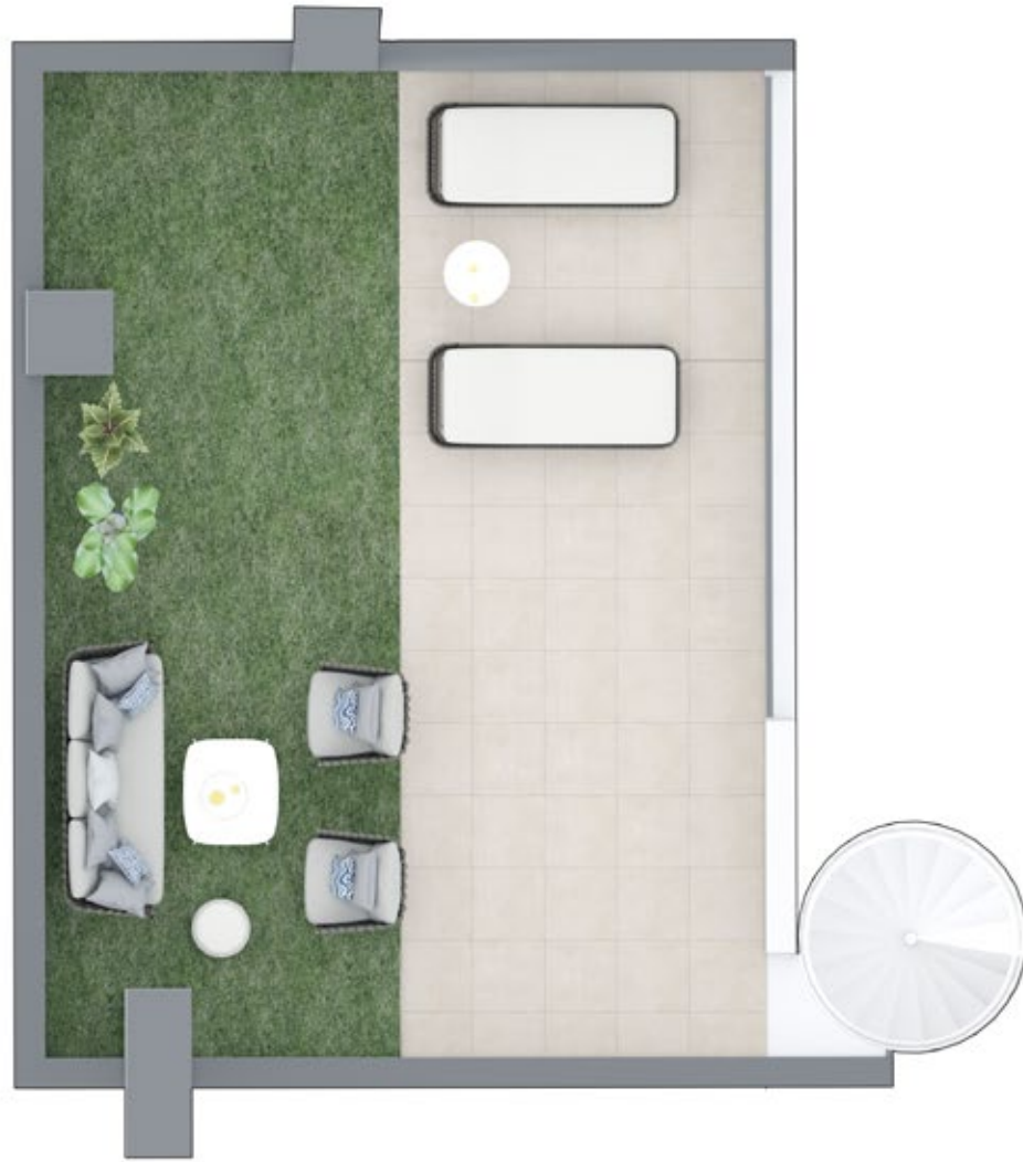
SOLARIUM - 3 BEDROOM LAYOUT