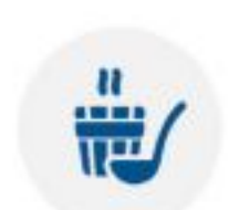
SAUNA & TURKISH BATH