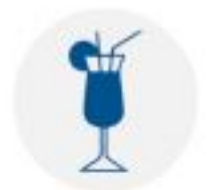
PRIVATE MEMBERS CLUB